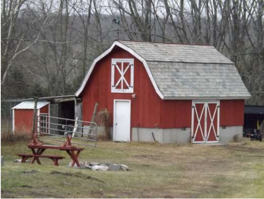
Barn and chicken coop Lush lawn with hay field beyond