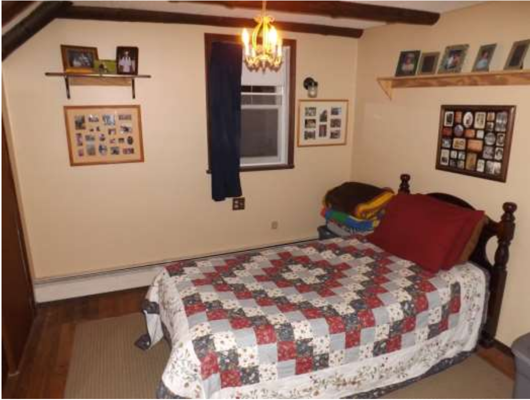
Third bedroom En suite laundry area