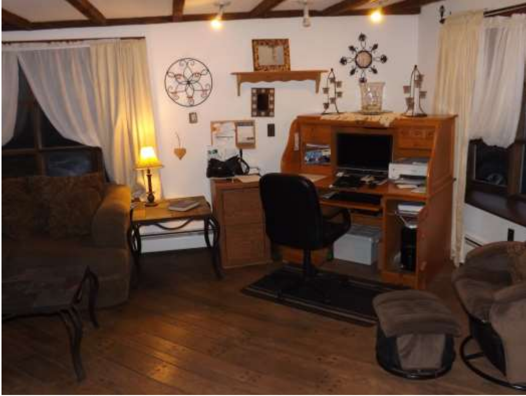
Family room Kitchen/breakfast area