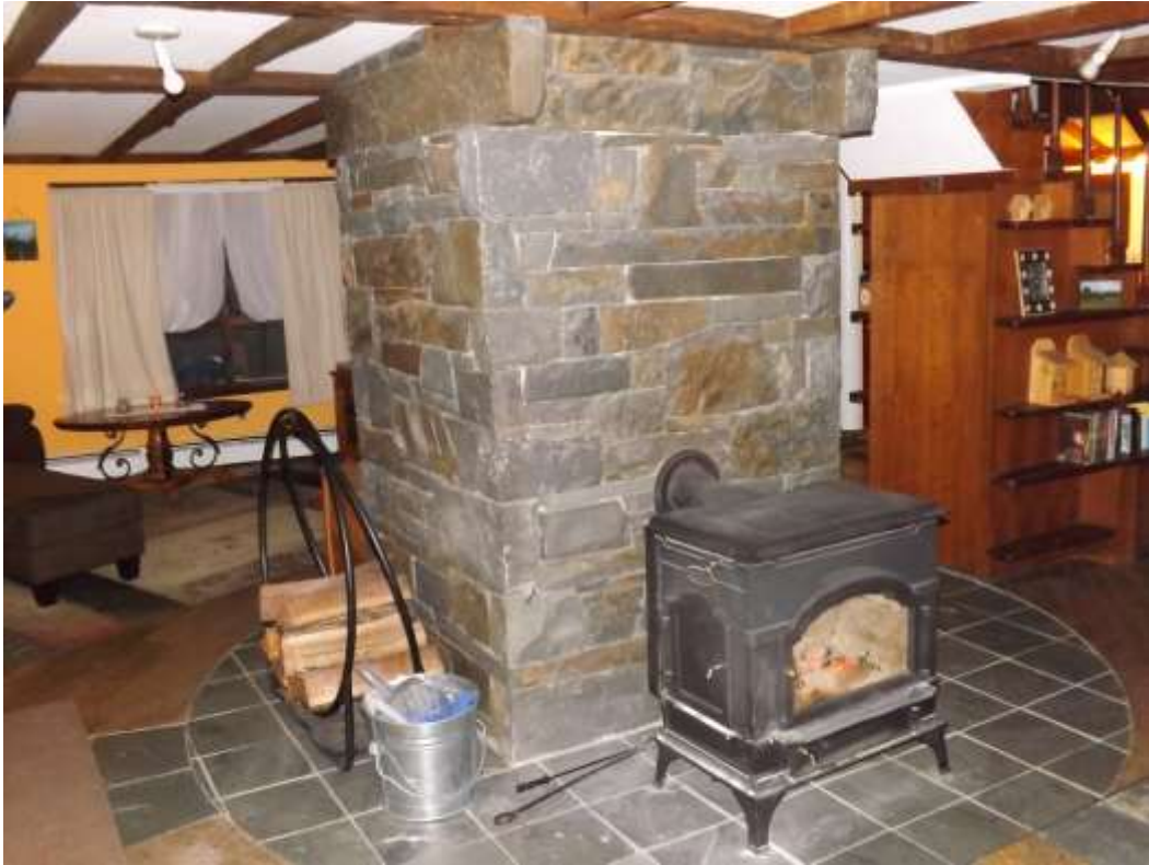
Stone center chimney for wood stove Living room