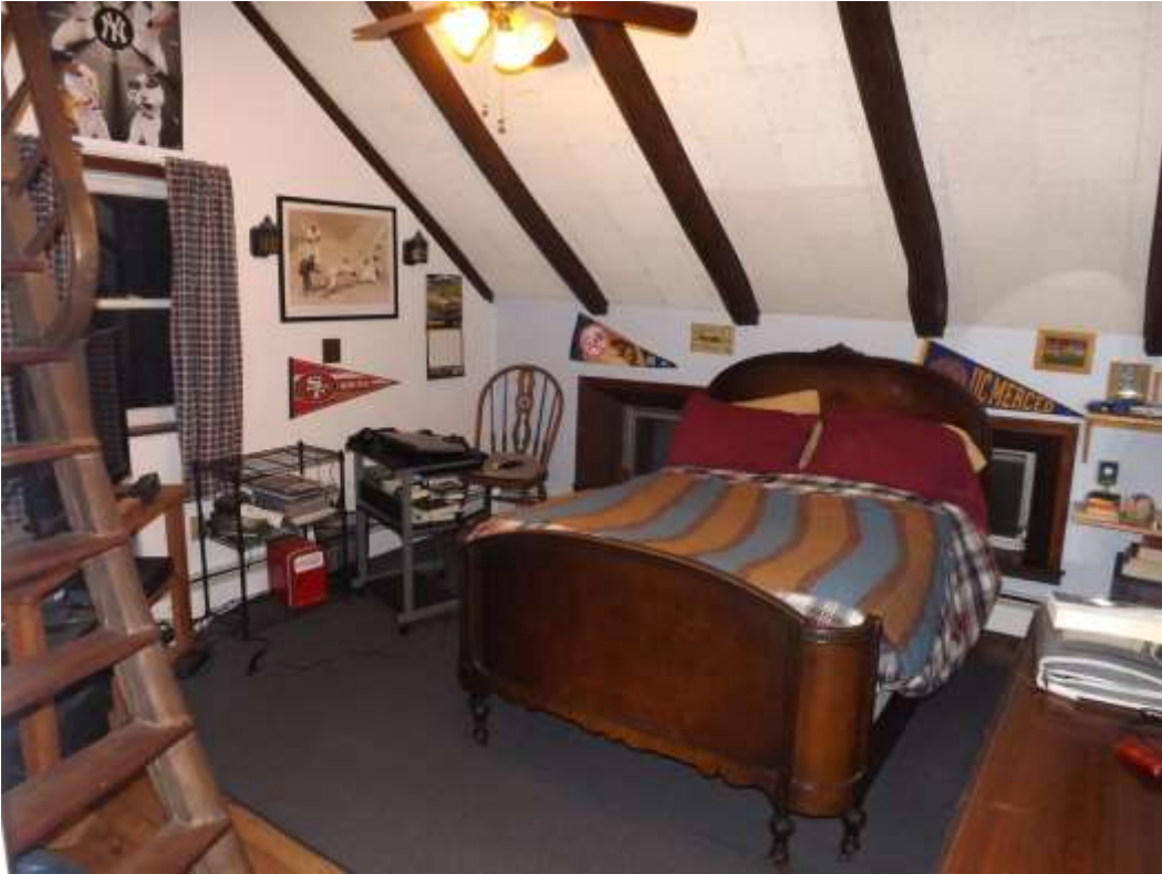
Second bedroom Stairs to loft