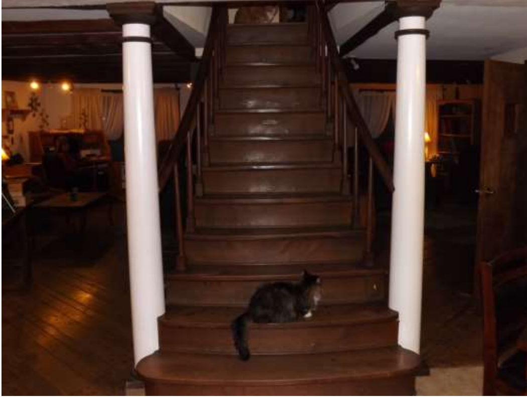
Custom staircase (cat not included!) Master bedroom