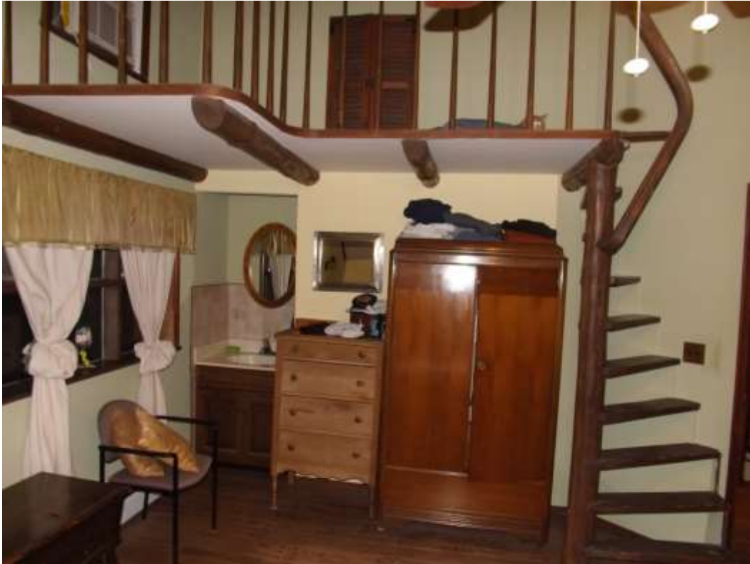
Loft in master bedroom leads to storage Second floor bathroom