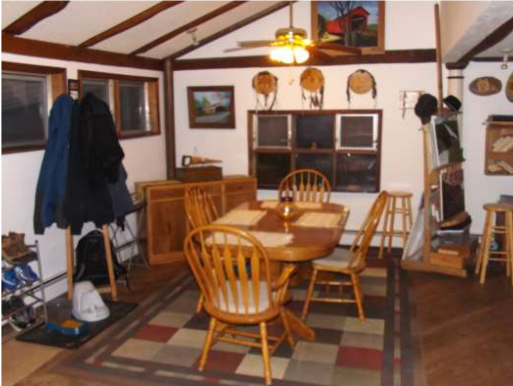
Dining area First floor bathroom